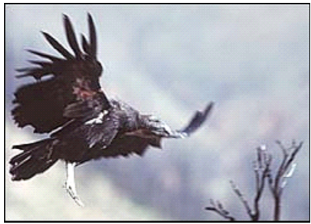
California Condor

Both parents are captive-released birds. The 10-year-old father is the dominant male of the southern California flock. He was released by Hopper Mountain Refuge in 1995. The seven-year-old female was released at Big Sur by the Ventana Wilderness Society in 1998. The parents will care for the chick until it is approximately 18 months old.